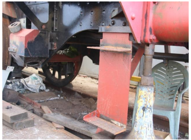
Trial fitting of the bunker steps