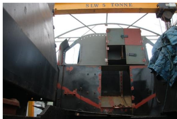
First strengthening angle fitted and inside welding started