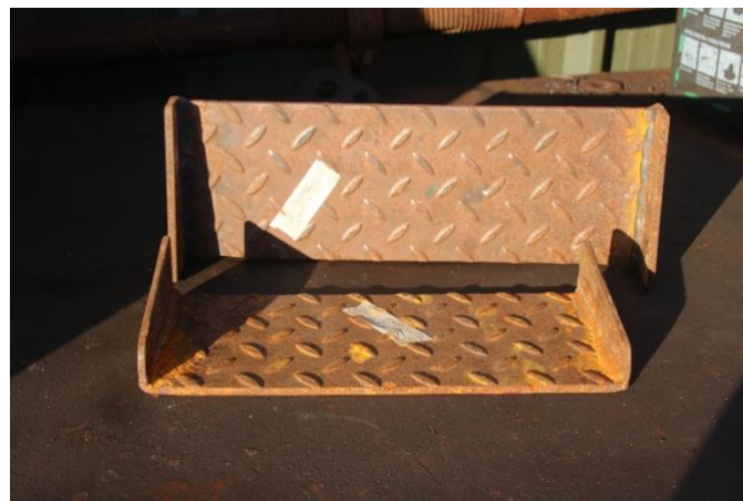
Steps under construction

As stated in our last newsletter it was decided to start the cab manufacture with the floor area. Manufacturing drawings of the metal panels had been drawn up allowing for the panels to be profiled by an outside contractor