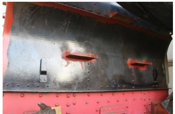
First lamp brackets fitted