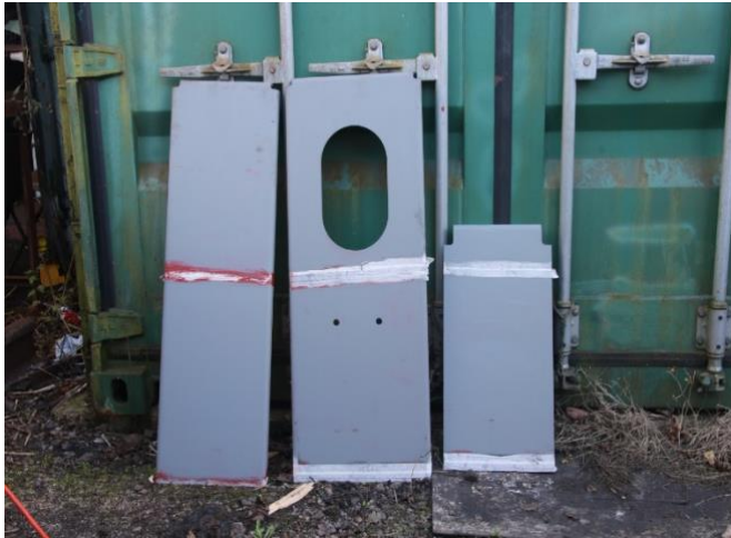
Profiled backing panels for the steps

Other areas we have been concentrating on are the access steps at the front, the cab and rear of the engine. Backing panels, supports and steps have been started with the backing panels profiled by an outside contractor to our drawings.