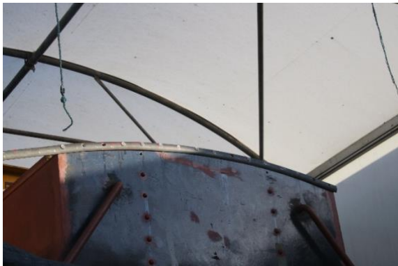
Rear panel beading being trial fitted

So as can be seen from the above and the photos below there is still a bit to be done before the bunker is finished