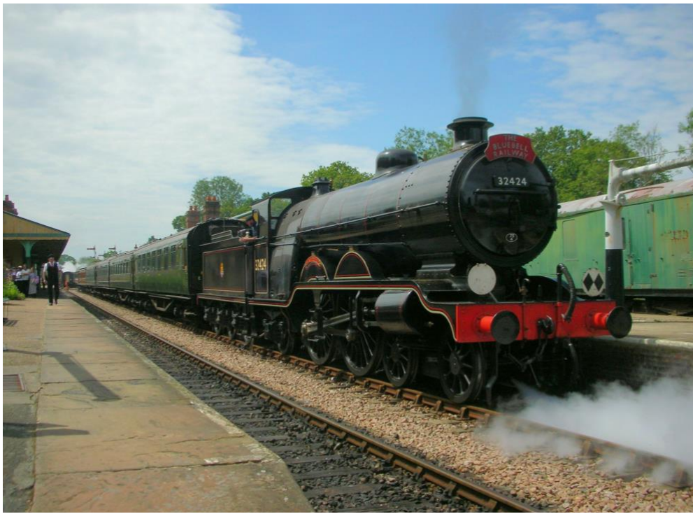
"Beachy Head" on a loaded test run at Hoprsted Keynes, 18 July 2024.