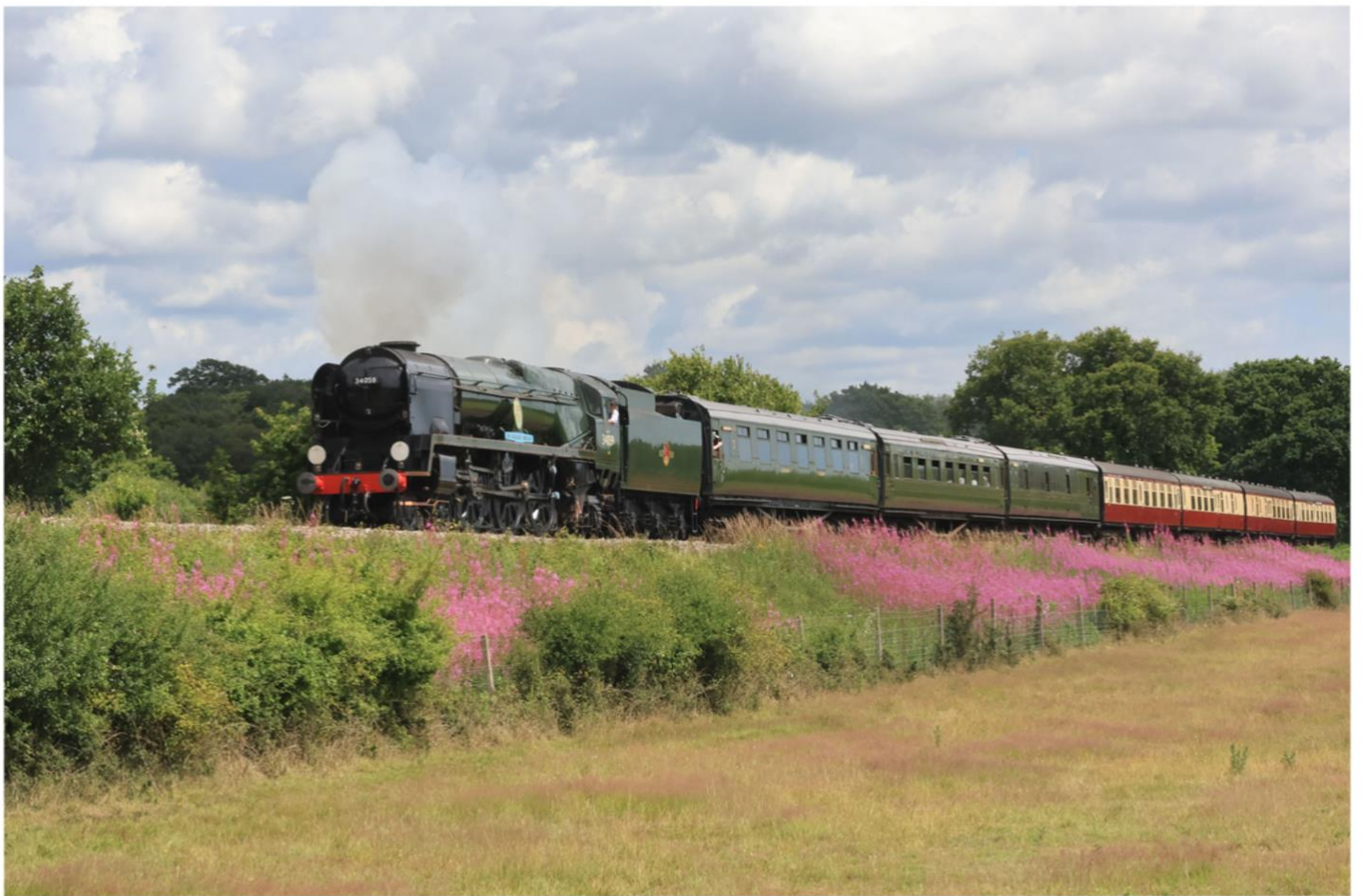
Sir Archibald Sinclair starting the climb of Freshfield bank with the 2.15pm train from Sheffield Park on 11 July. The train included three Maunsell carriages and the four Mk 1 carriages of the Wealden Rambler set for an Afternoon Tea service.