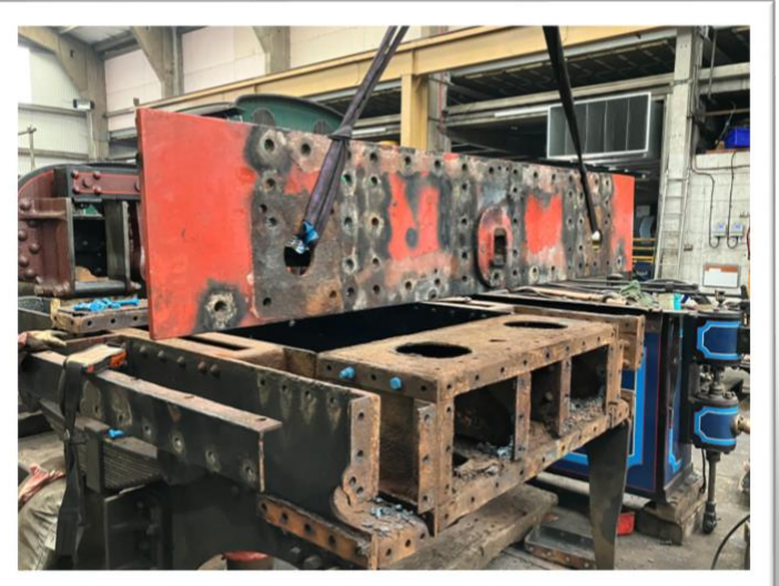
Left: View of the top of the main section of 541's rear dragbox, prior to riveting.