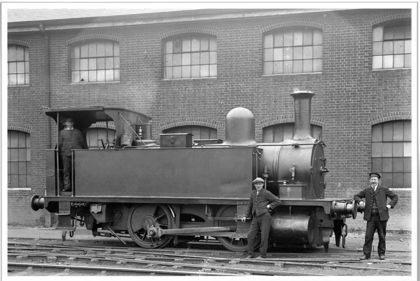
LSWR B4 No. 86 'Havre' at Southampton Docks on 7 June 1924.

Do you have an interest and experience in scanning railway negatives and slides? We will be looking to expand our team of volunteers later this year. If you think you could help and would like to find out more please email: photos@bluebell-railway-museum.co.uk .