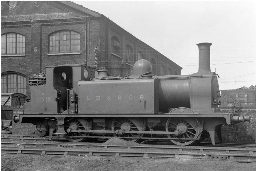
Former LB&SCR E1 No. B159 at Bricklayers Arms on 14 June 1924. Note it is still in LB&SCR livery but has already acquired the Southern Railway "B" prefix to the number.