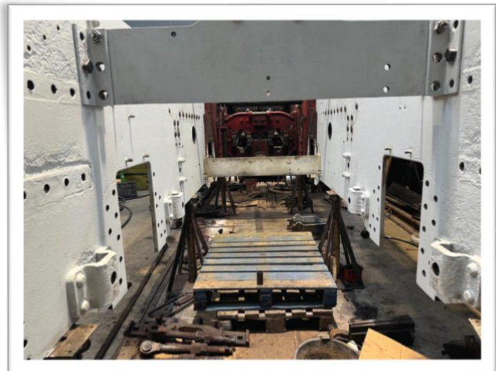
Top: Left hand leading horn block back in position in the frames after machining of horn tie faces.