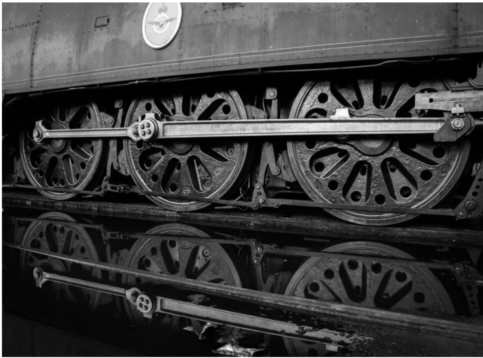
Reflections at Sheffield Park