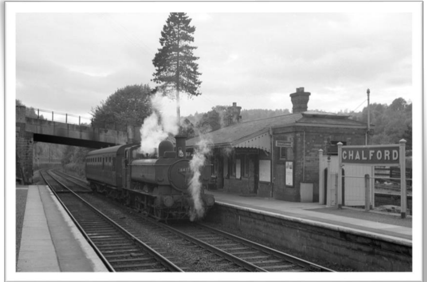
Top: o-6-oPT No. 6437 at Chalford station with the local train from Gloucester, on 19 May 1962.

The images in the Archive are predominately Southern but we always prefer to keep a photographers collection together which is why you can find images from across the UK and Overseas on the museum website.