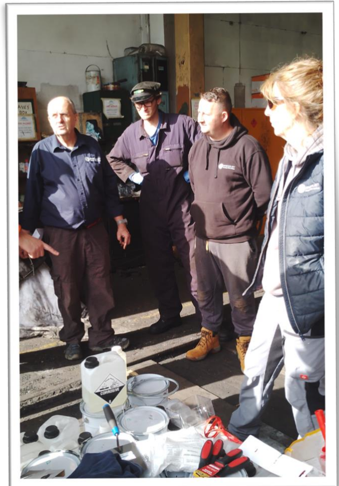
The team from Specialist Coatings GB

unlike bitumen there is no odour from the product as it is not based on solvents for drying. Once dried the coating forms a flexible waterproof bond. When the whole tank is completed, it will be light due to the light grey colour and we shouldn't need