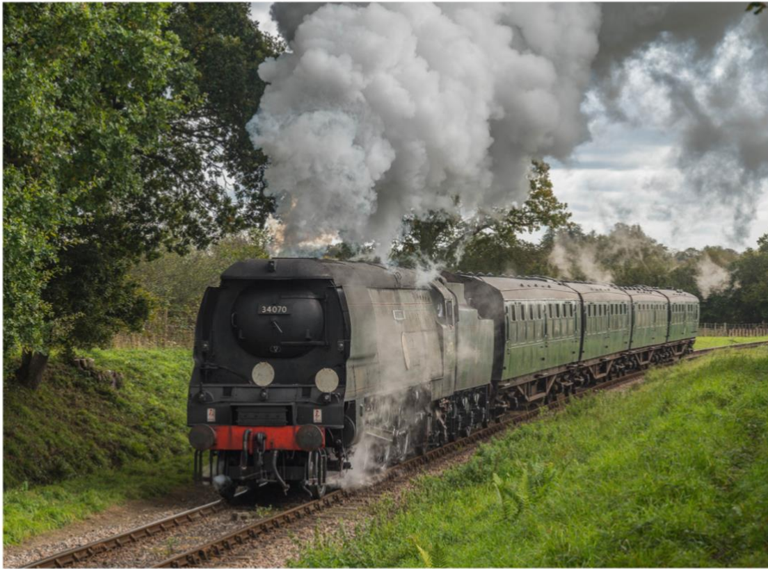
Another photo from the charter.