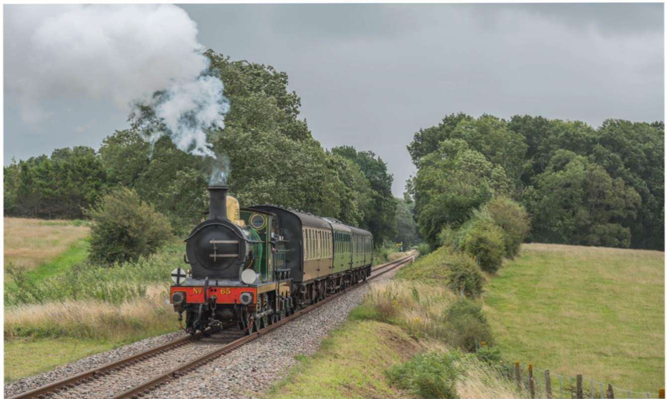
Above: Stirling O1 No. 65 climbs Freshfield Bank with a service train on 2 August.