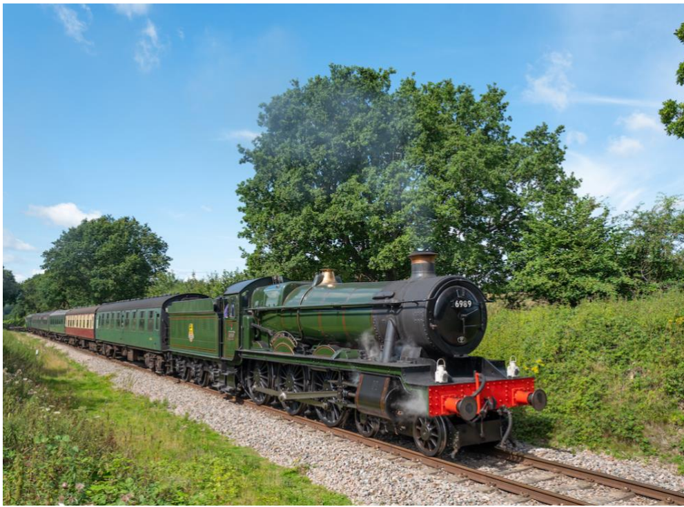
'Wightwick Hall' at Hazelden Farm, 7 August.