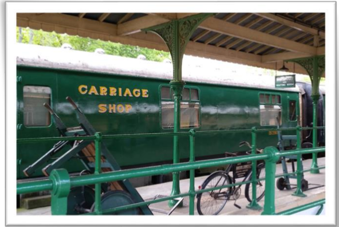
Above: The Carriage Shop on Platform 1 of Horsted Keynes station

The Carriage Shop is open for additional days in August including days when the Flying Scotsman is running. For all the latest news and other opening times please visit our Facebook page: facebook.com/BluebellRailwayCarriageShop