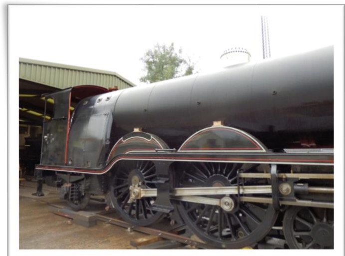
Progress through the boiler lift.