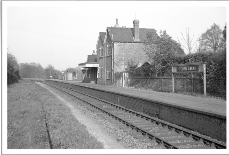
Left: [081994] View of Itchen Abbas station as it was on 1 May 1966, seven years before closure.