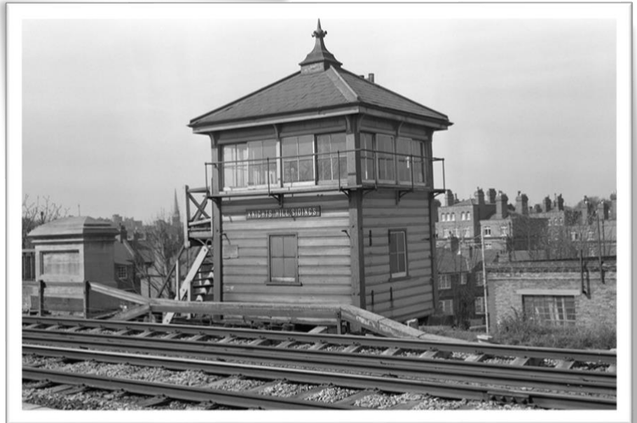
[082014] Knights Hill Sidings signal box on 9 April 1969. John Scrace