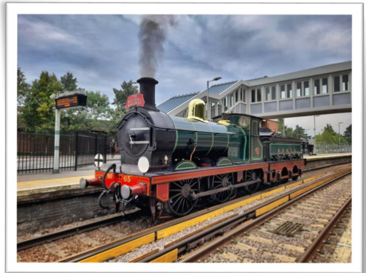
No. 65 at East Grinstead mainline station, with the new footbridge behind.

Representatives from the project team will be available to answer any queries and take on board your comments. We look forward to seeing you and discussing the proposals.