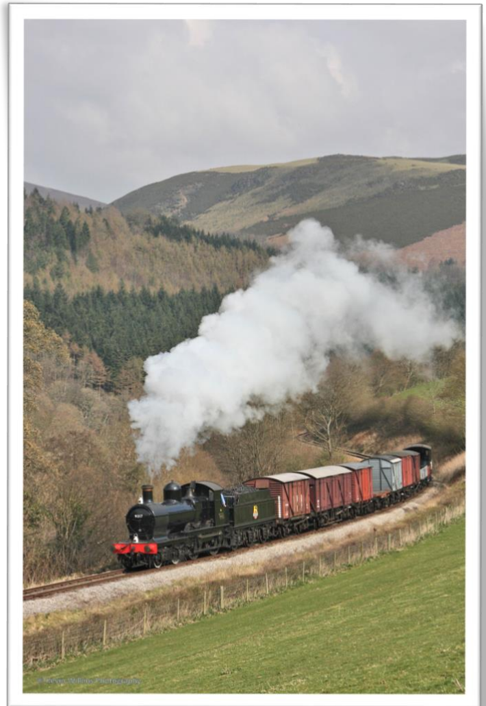
9017 on a visit to the Llangollen Railway in 2009.

The full description of the boiler lift of Beachy Head is covered on the project's dedicated web pages . The history of the Dukedogs was covered in the March 2021 issue of The Bluebell Times – Ed.