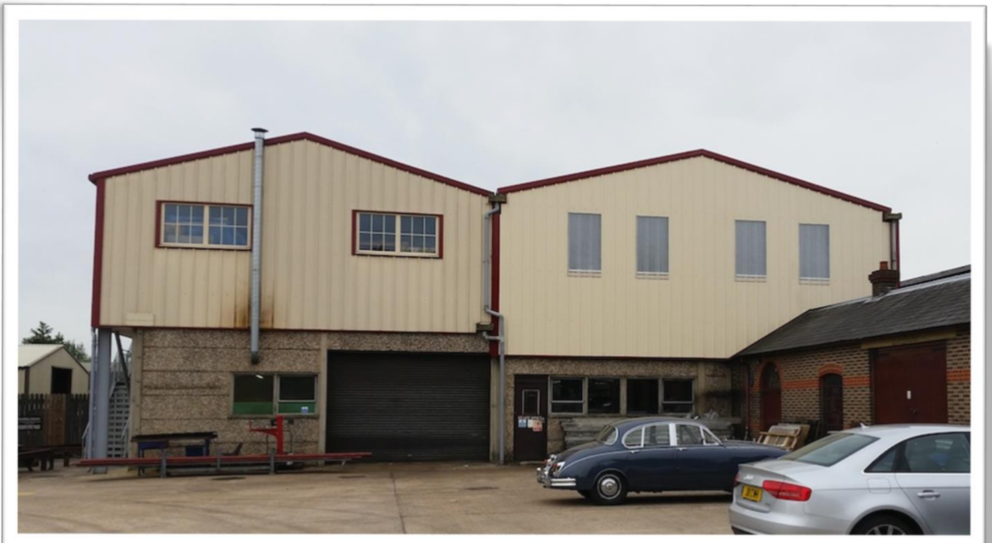
The above workshop facility (left) and Locomotive workshop (right), showing the valley between the two structures.

Conscious of the need to preserve the heritage appearance of Sheffield Park, the panels will be located on the west-facing roof of the AWF and the east-facing roof of the Locomotive Workshop – therefore, hidden in the valley made by the junction of roofs of the two structures. They should be out of sight from the ground but may be glimpsed from part of the footbridge between Platforms 1 and 2. Ideally of course solar panels