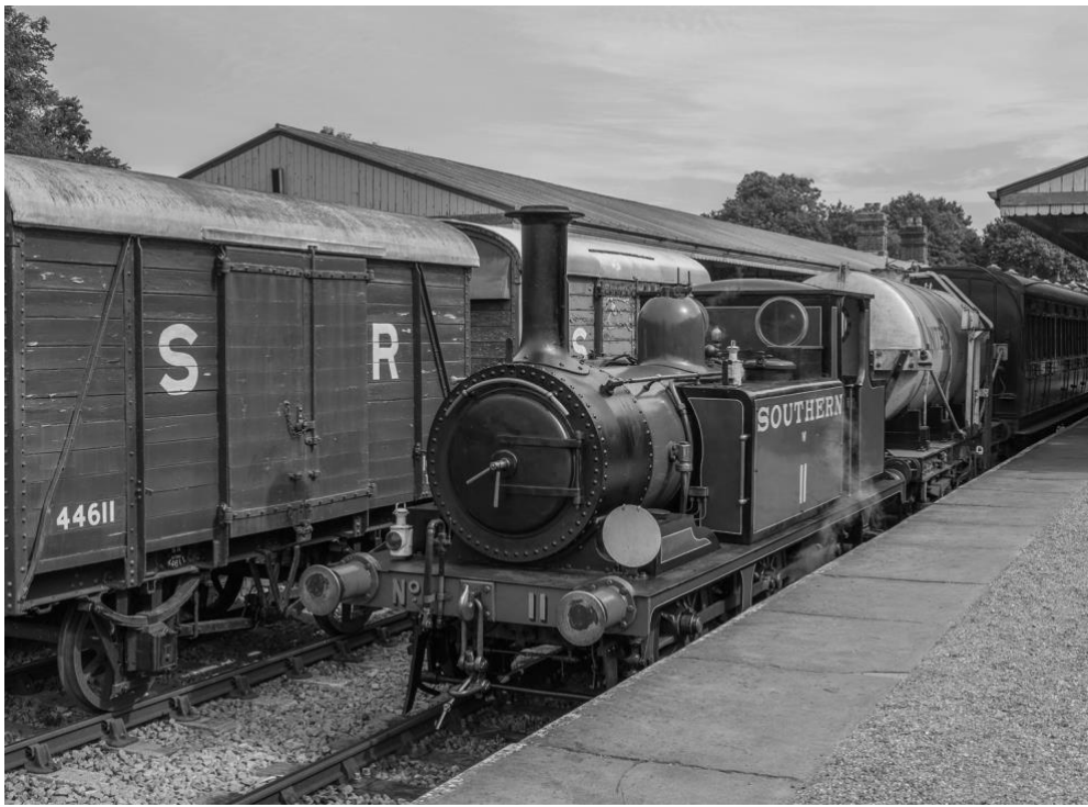
Masterpiece in miniature: Stroudley Terrier W11 with a perfect Southern scene