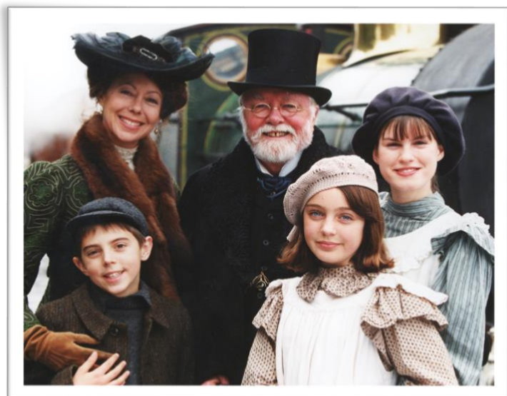
(Above) 'The Woman in Black' (2010) with Daniel Radcliffe