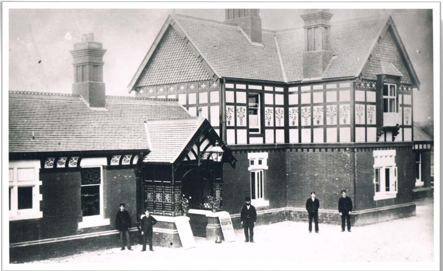
The station shortly after opening. At this time, the upper story of the station house still had a faux half-timbered appearance – the hung tiles came later to provide better weather protection. The stained glass in the booking hall porch was recently re-instated.