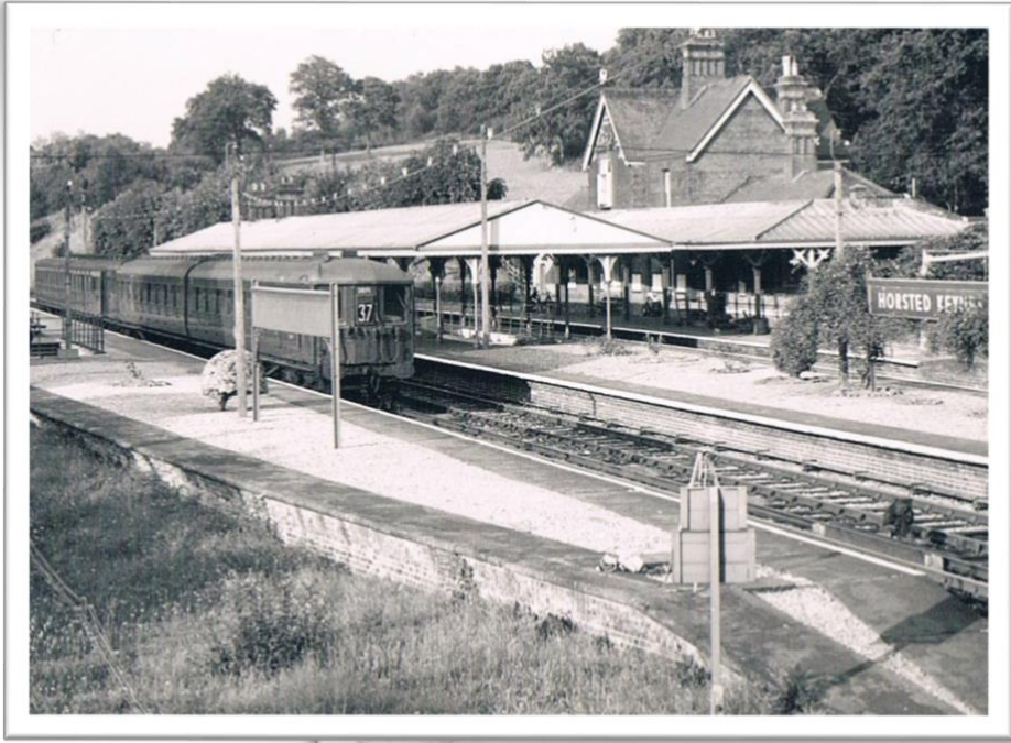
(Left) The next significant change was electrification of the line from Ardingly. That may seem to have been an extravagance, but essentially it enabled units on the Seaford – Haywards Heath service to run to and from Horsted Keynes out of the way, rather than lay over at Haywards Heath, blocking a platform on the busy Brighton Mainline. By the time of this 1950s view, the platform line at the back of the island platform had been removed, as well as all but one of the “up” sidings.