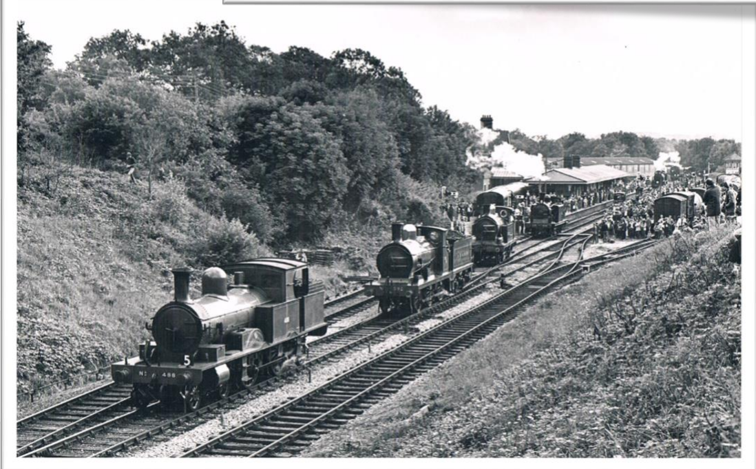
(Left) The Bluebell celebrated the centenary of the Lewes and East Grinstead Railway in 1982 – the station is seen during a cavalcade of locomotives at that event.