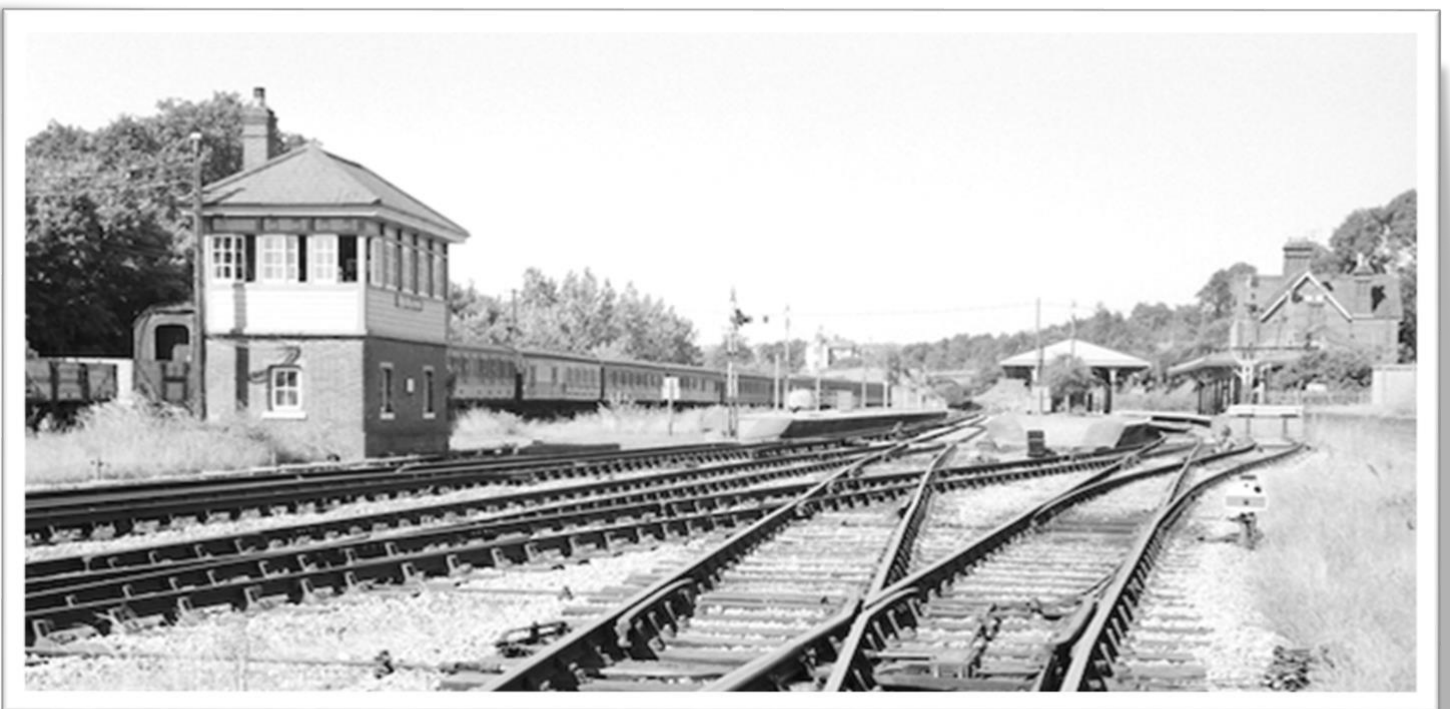
Horsted Keynes in 1959, on the eve of preservation. At this date, the line to Sheffield Park was closed, but electric trains were still running in via Haywards Heath. Lines of redundant carriages displaced by the Kent Coast electrification project are stored in the sidings on the west side of the station.

So, please, please support the Appeal in every possible way so that together we can restore Horsted Keynes to its rightful place as the "Jewel in the Crown" for now and into the future.