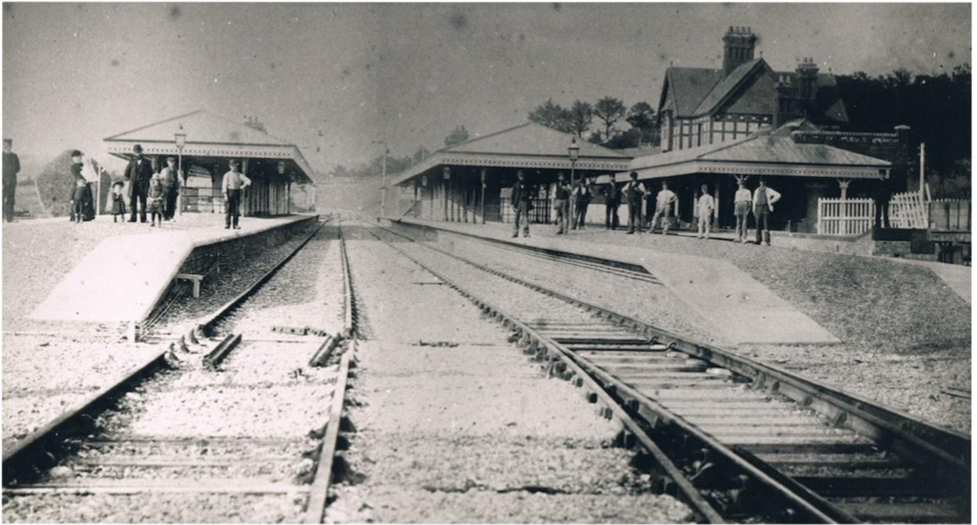
The station in August 1882, just prior to opening. The figures on the left are William Yeomanson, the station's first Station Master, and his family. Those on the right are workmen involved in construction of the line.

As built, the station had two signal boxes and the junction between the Lewes and Haywards Heath lines was at the north end of the station. In order to save costs, in 1914 the station was rationalised. The junction was moved to the south of the station; the north signal box was downgraded to a shunting frame, and the canopies and buildings on the western island platform (the current platforms 1 / 2) were removed to give the signalman a clear view of the north end of the station.