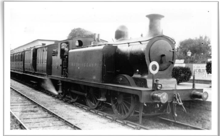
Billinton E4 No. 581 Warningcamp – probably the locomotive involved in the accident.