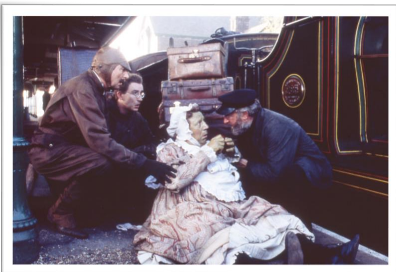
(Below) Eric Idle, Steve Coogan and Terry Jones in 'The Wind in the Willows' (1996)