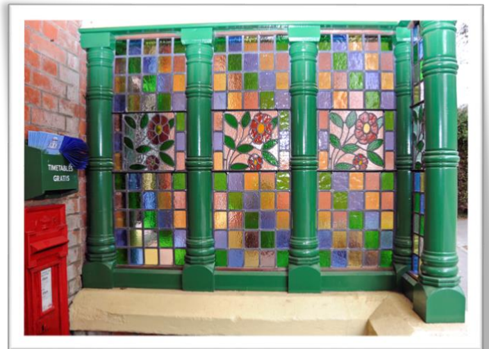
The restored stained glass in the porch at Horsted Keynes – compare with the photograph on page 7.

In summary nearly £2 million has been raised in the past 25 years towards projects located at Horsted Keynes. Let's hope that the 'Jewel In The Crown' appeal will continue to receive such support and be equally successful.