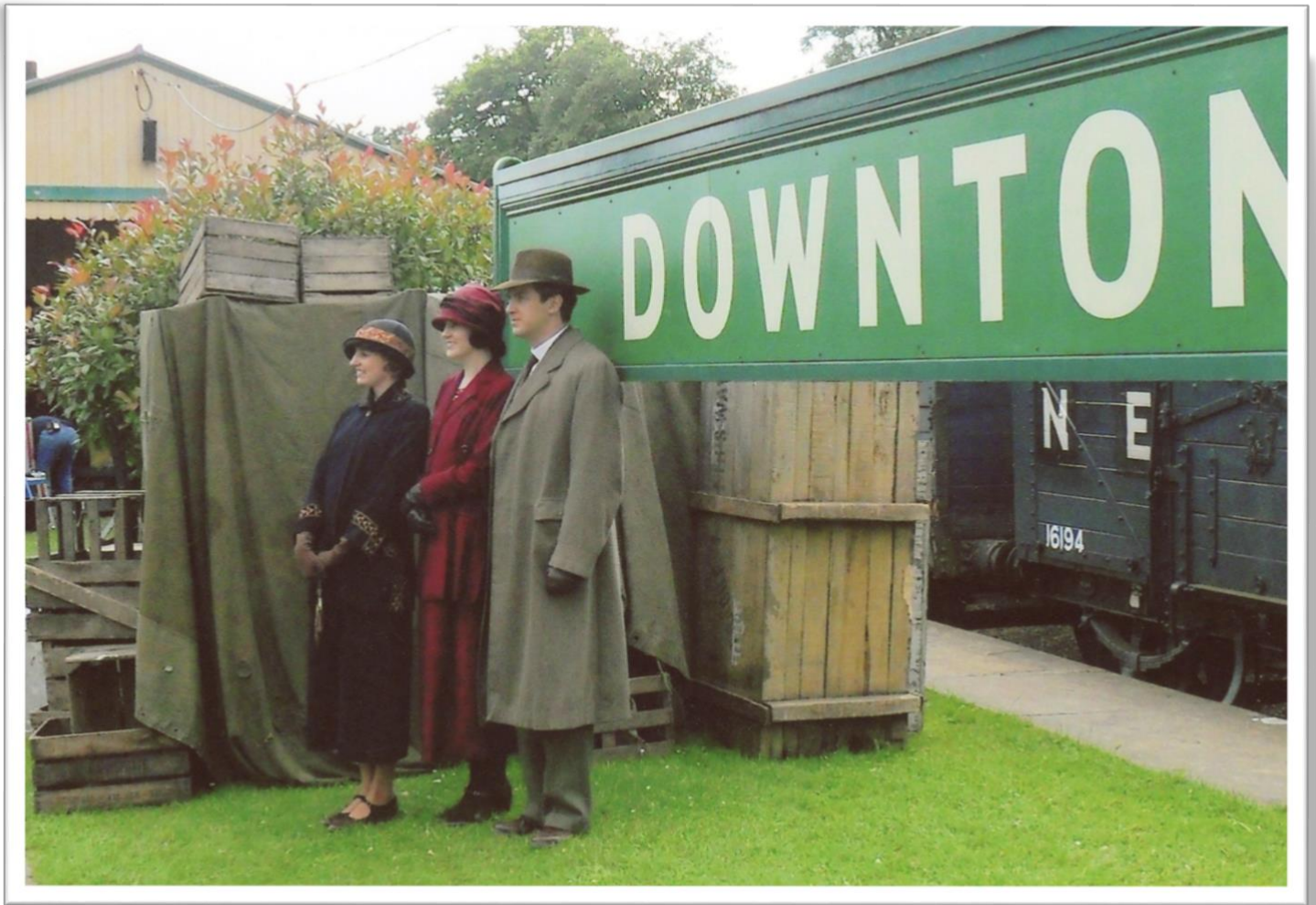
(Above) Horsted Keynes transformed to 'Downton' station in Downton Abbey (2011 – 2014)