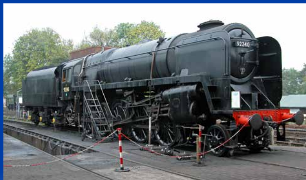
92240 at Sheffield Park Loco yard in 2005

We will also be launching fundraising targets for specific parts of the locomotive's restoration once the restoration work is underway.