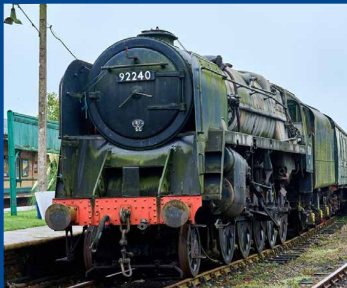
External condition of this sleeping Giant, Autumn 2021

We are currently fundraising to raise £500,000 to get this great locomotive back into steam, although there is still a substantial amount to raise before we see any fire in the belly of this Giant!