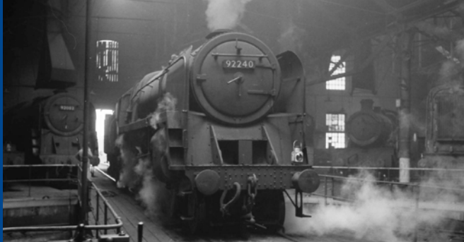
92240 in in Tyseley shed - 20 June 1965