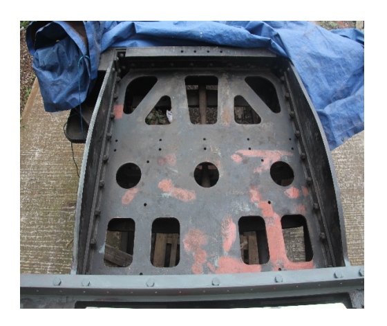
Chassis where the bunker is positioned

Progress on the bunker has been made in a number of areas, all recently received profile plates have now got a coating of protective paint and many of the angle support structures have or are in the progress of being made.