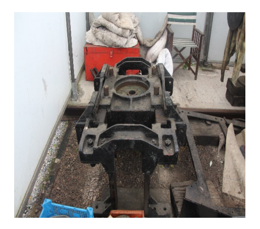
Front Pony Truck Casting and Reins

The bunker unfortunately is outside of our protective polytunnel as the engine is nose in and too long to fully fit in. When the front pony truck can be assembled and moved under the engine more space will be created and the engine moved further in.