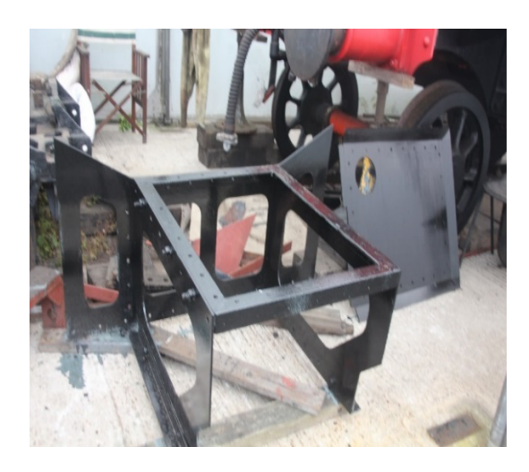
Shovelling plate framework

Progress on the bunker has been made in a number of areas, all recently received profile plates have now got a coating of protective paint and many of the angle support structures have or are in the progress of being made.